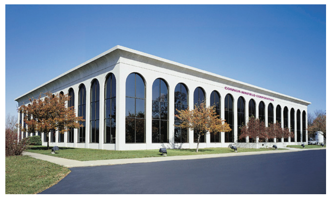
Headquarters at 2111 Comprehensive Dr, Aurora, IL

product is ever assembled. By maintaining our ISO 9001:2000 Quality System certification, continuous improvement to our processes is a commitment we make to constantly go beyond the expectations of our customers. For us, quality is not just a technique or system. It is an all encompassing and uncompromising philosophy to produce products that not only precisely meet our customers' quality requirements, but also surpass them in every way.